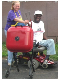
Cooks at the neighborhood Party on the Plaza picnic

The Church for All People was founded in 2003 with the mission of being the church at the heart of both community renewal and personal transformation. From housing to health to music, its programs provide a model and inspiration for urban ministry across the world.-