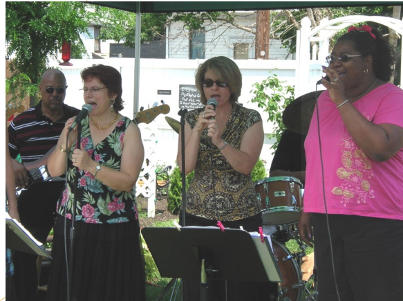
The All People Band performing at Ganthers Place Neighborhood Arts Festival